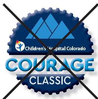
Using Additional Filters or Drop Shadows