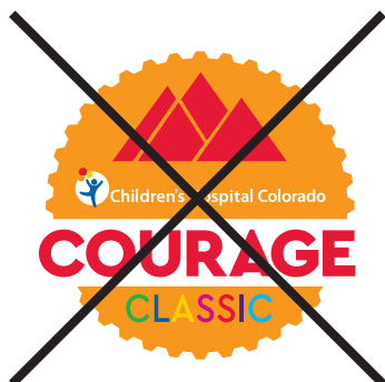
Improper Color Usage