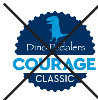
Adding, Subtracting, or Breaking up of the Logo