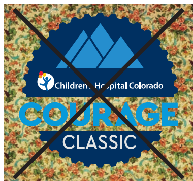
Placing the Logo on a Busy Background